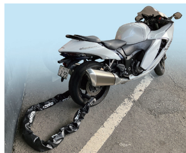
HAYABUSA 1300 (EJ11A)