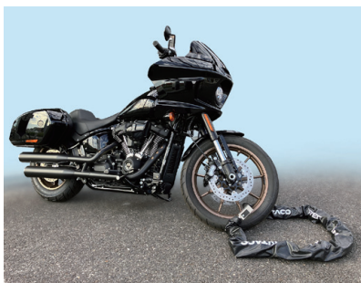
Low Rider ST

● 2.3 m length enough to lock with pillar and ancker at home.